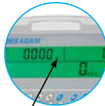
Large backlit display