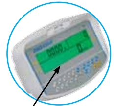
Sturdy plastic design